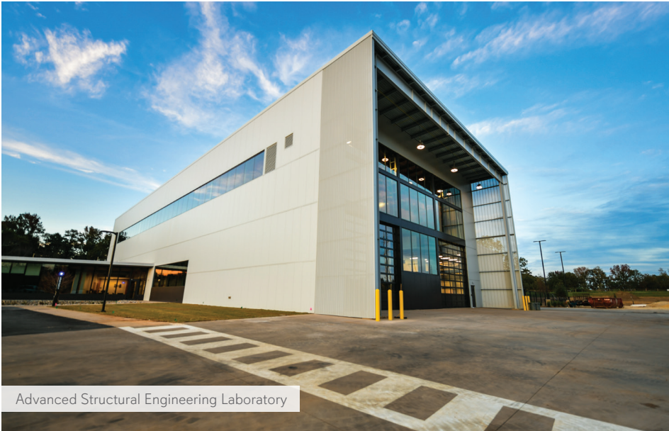
Advanced Structural Engineering Laboratory