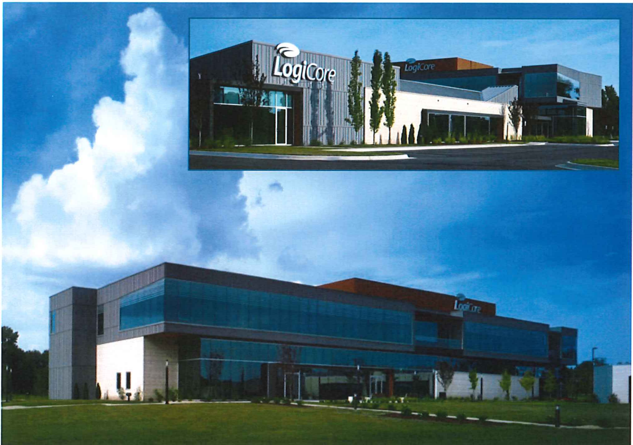
Figure 2. Ground views of LogiCore buildings.