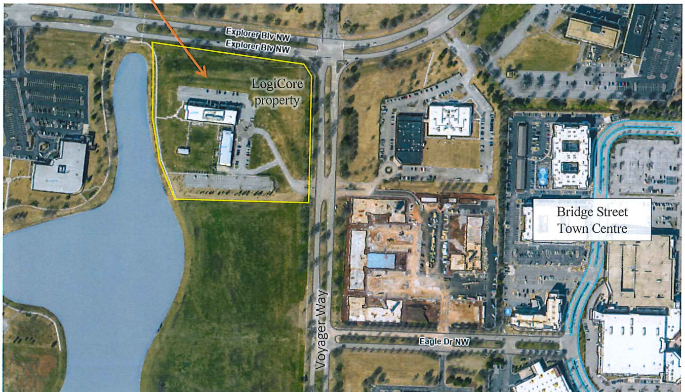
Figure 2. Aerial view of LogiCore property and nearby Bridge Street Town Centre. Property address is 345 Voyager Way NW, Huntsville, AL.