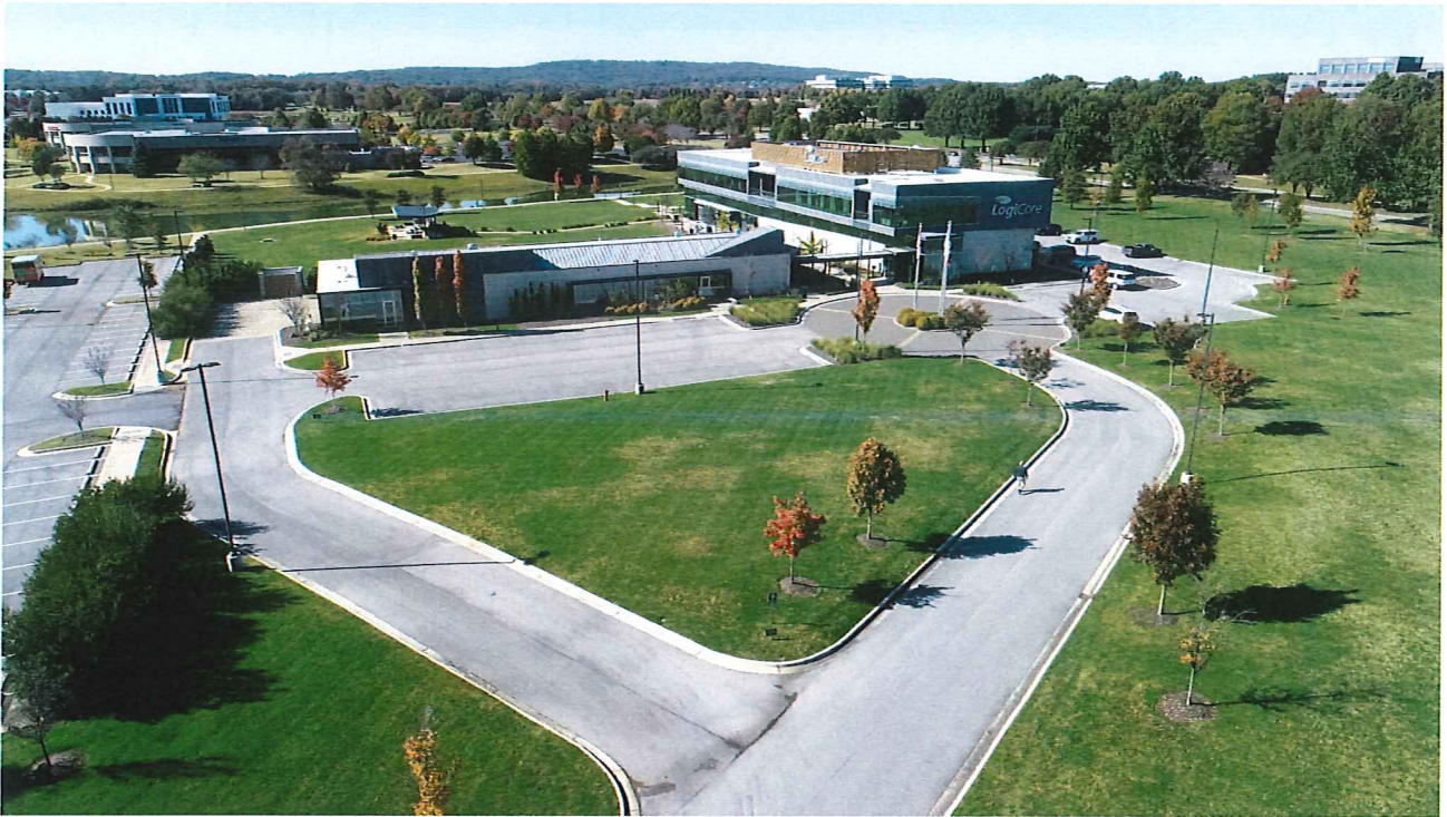
Figure 1. Elevated view of LogiCore property looking west from Voyager Way.