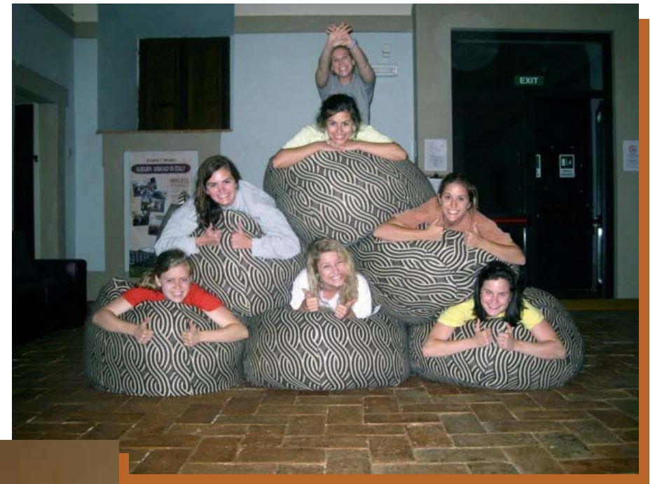
Forming the Chigi Symbol