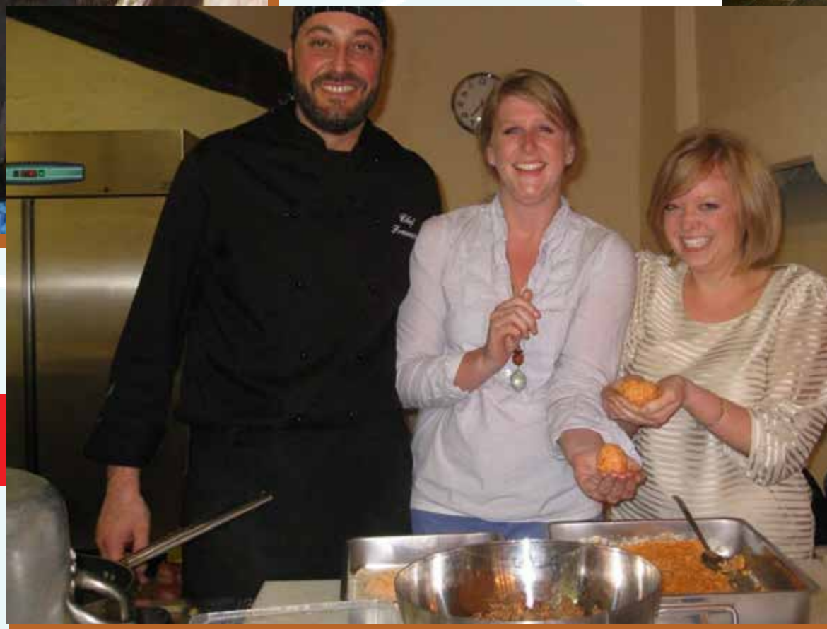
Preparing a meal together