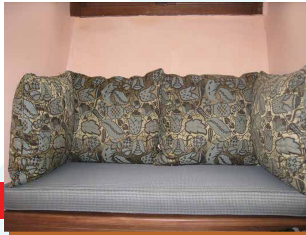
Great place to read a book!