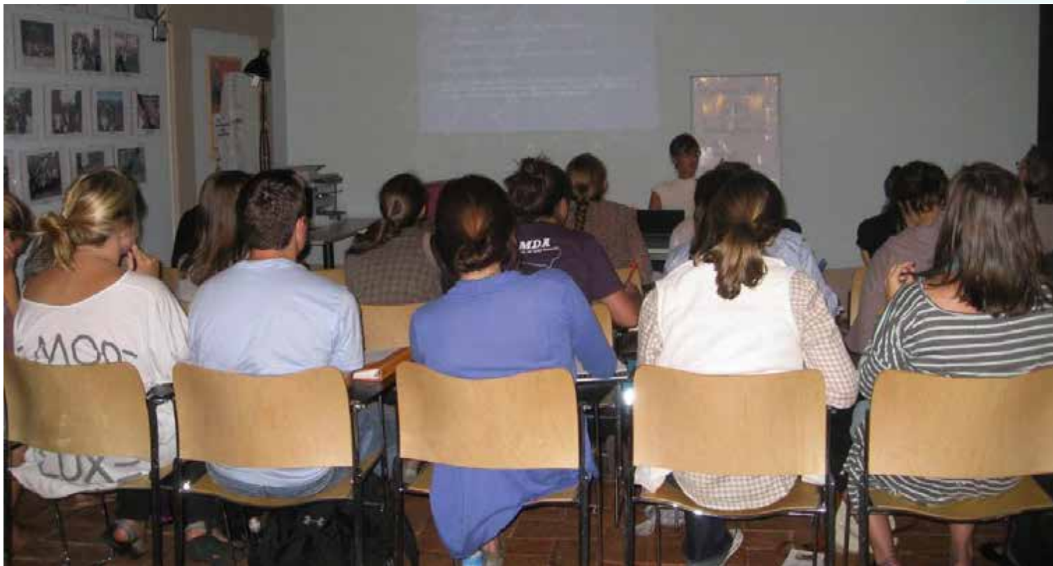
Learning about Italian history