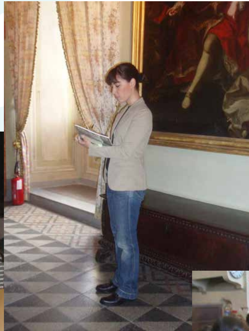
Tour during art history class