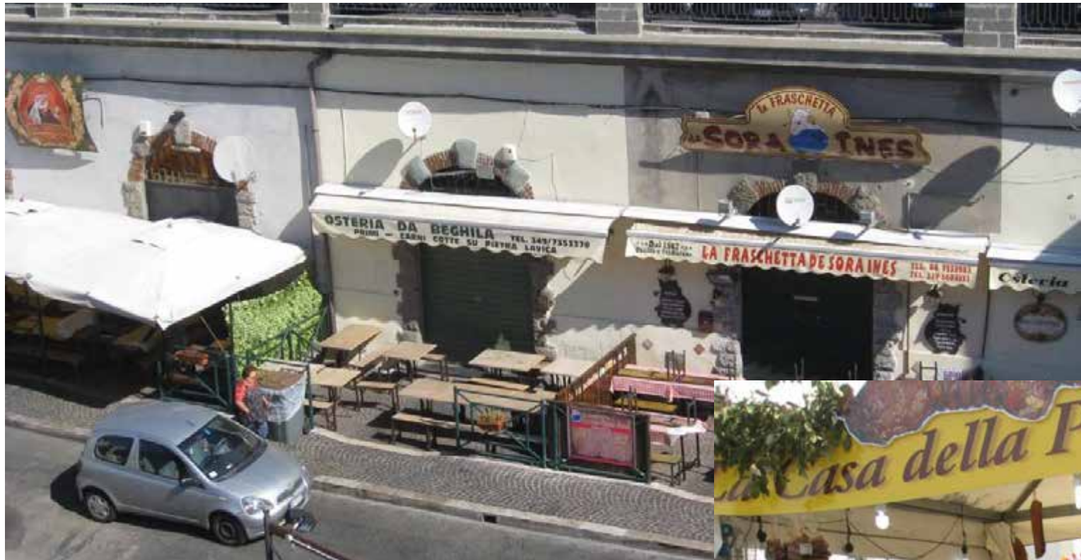
The local fraschette (restaurant)