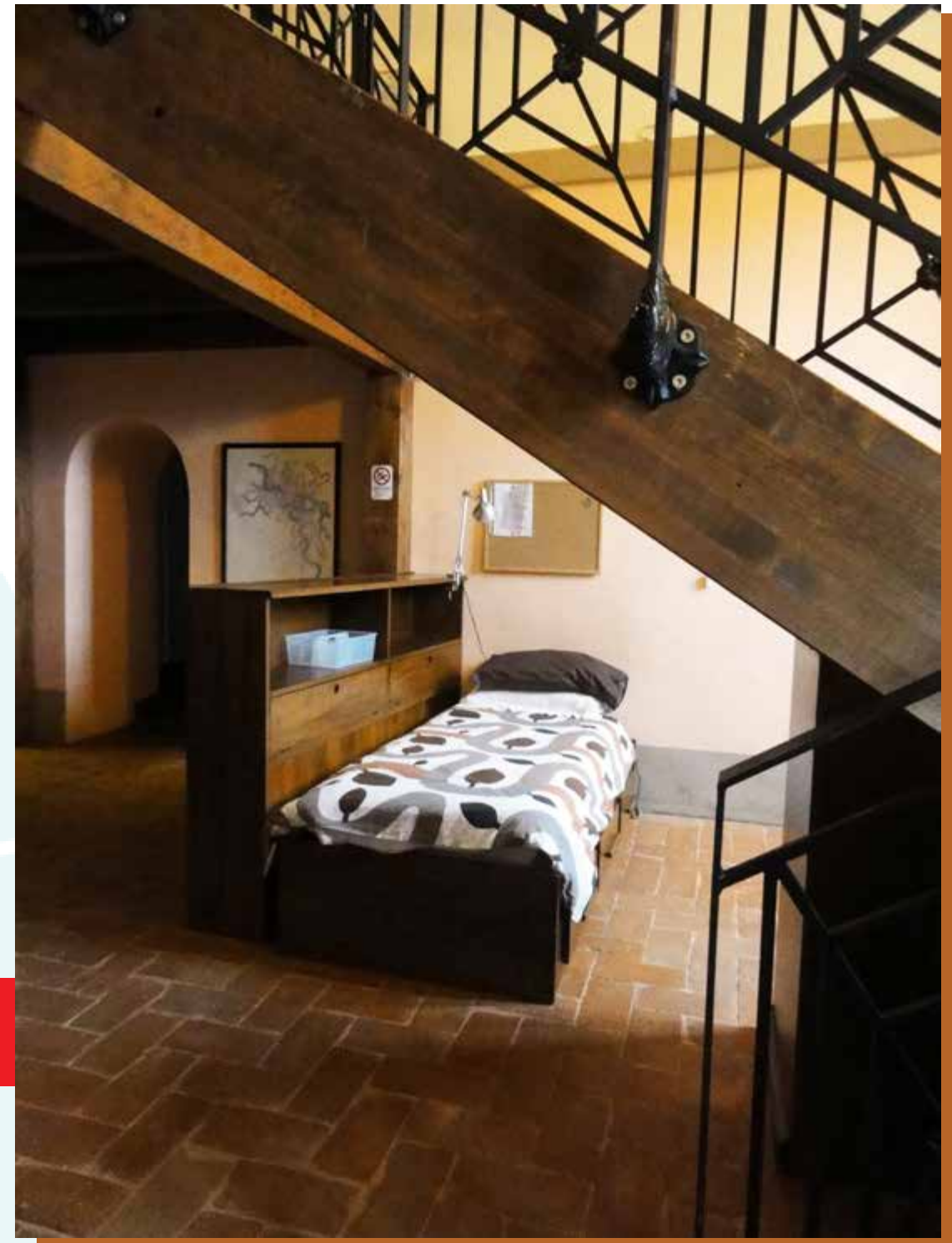
A "Nest" beneath the stairs