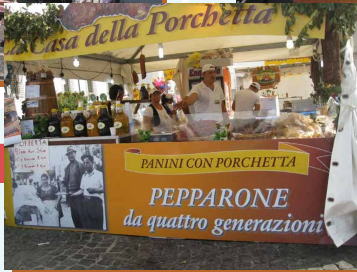
Porchetta Festival held each Fall