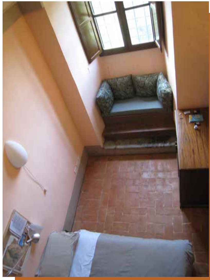
View of bed and window seat from the loft