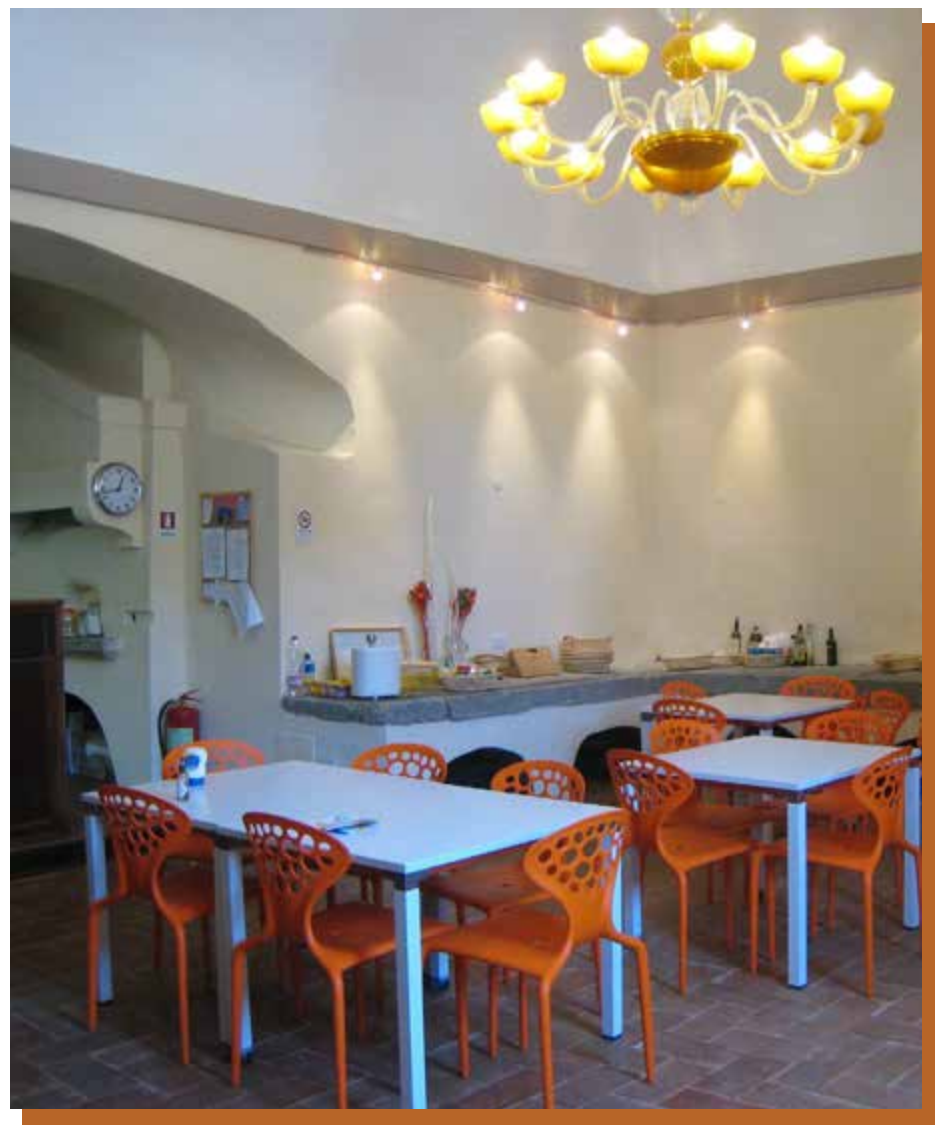
Kitchen and dining