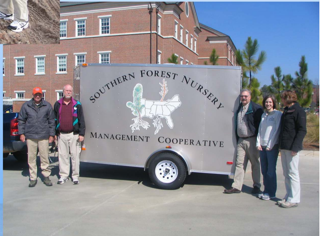
Coop staff with our “state of the art” trailer