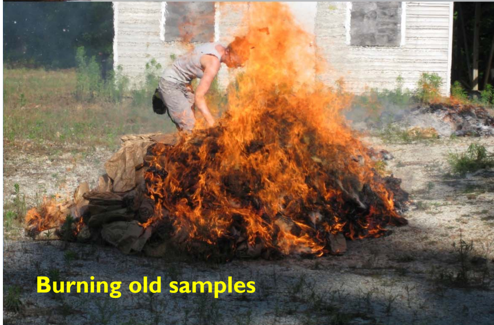
Burning old samples