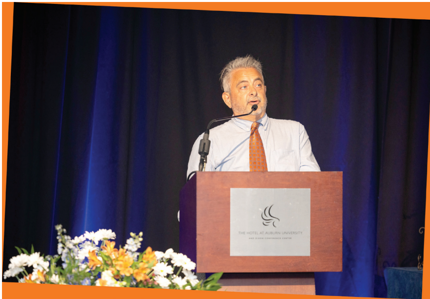
Professor of Educational Psychology, Executive Director of O Grows