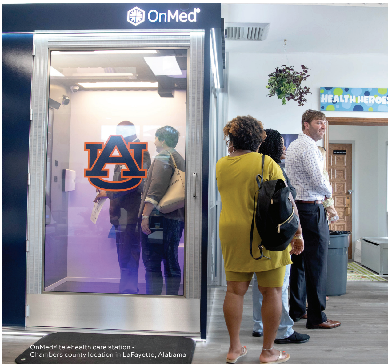
OnMed® telehealth care station - Chambers county location in LaFayette, Alabama

Auburn University is pioneering innovative, collaborative solutions to deliver healthcare to Alabama's rural communities who lack access.