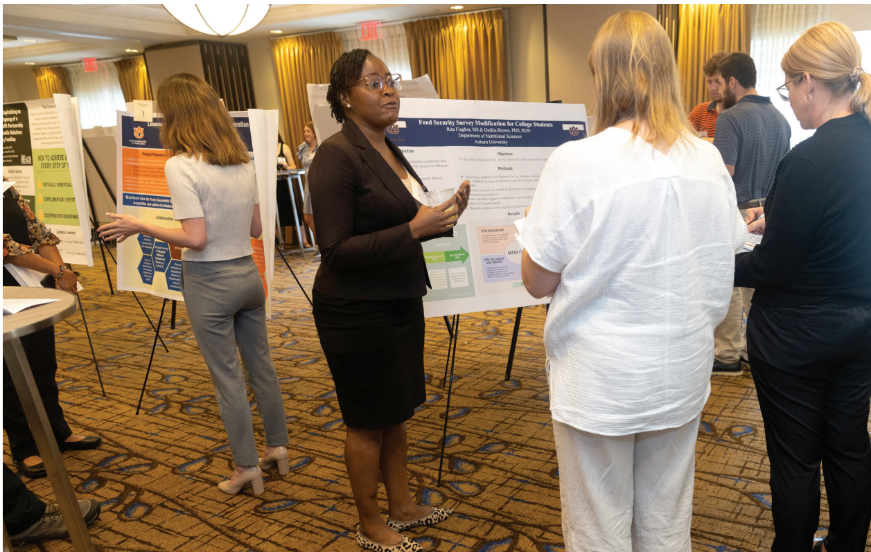
Graduate student poster presentations at the 2024 Outreach and Engaged Scholarship Symposium.

Providing campus-wide support, advocacy and leadership in the promotion of outreach and community engagement at Auburn University.