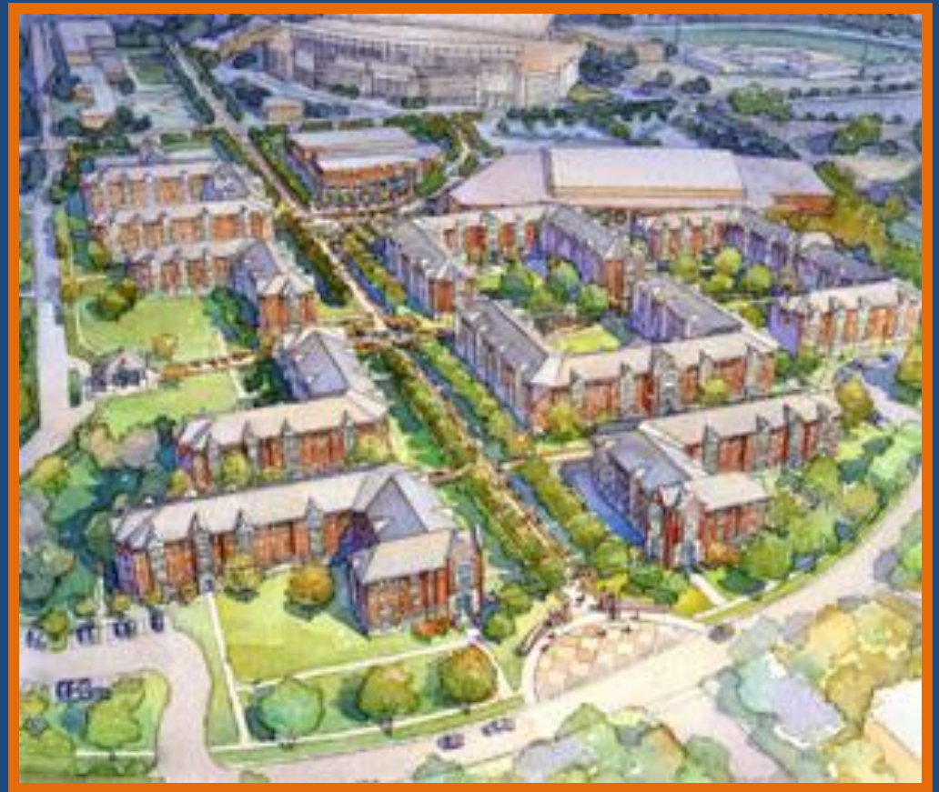
Village Housing Complex