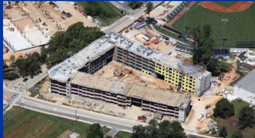
West Samford Residence Hall