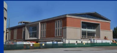
Student Wellness Center