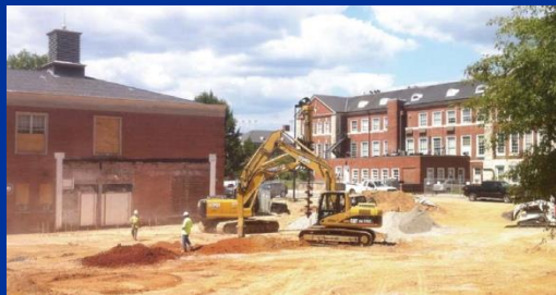
BioDiversity Learning Center