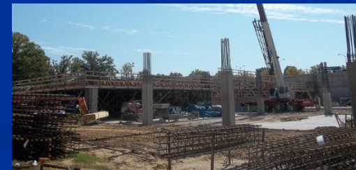
Biggio Drive Parking Structure