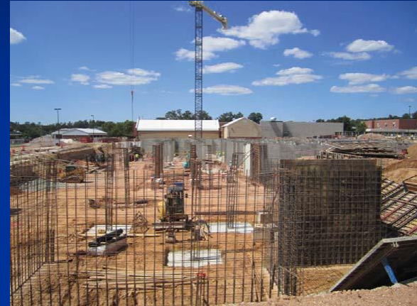
Small Animal Teaching Hospital