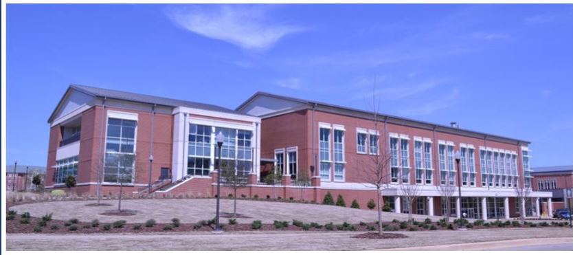
Kinesiology Facility ($16M)