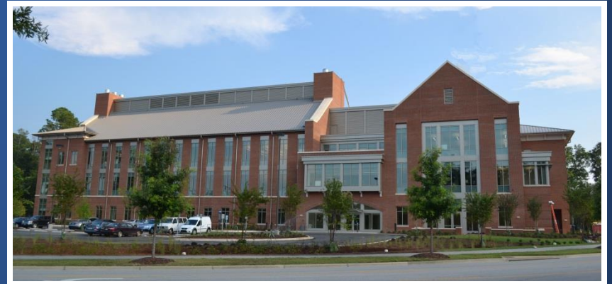
CASIC Facility ($19.6M)