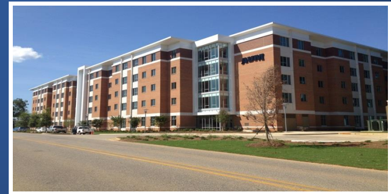
AUM Residence Hall ($28M)