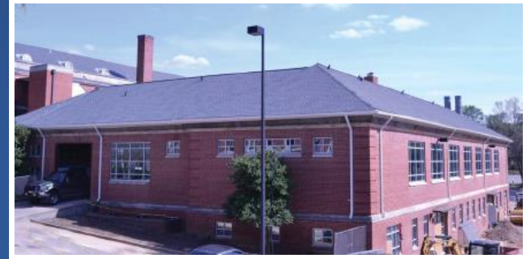
Biological Engineering Research Lab ($5M)