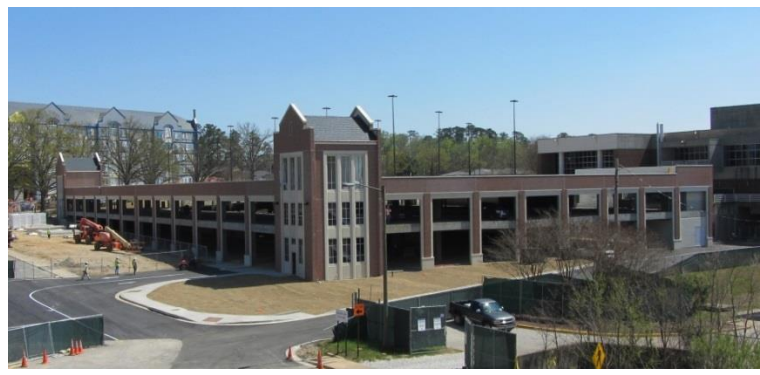
Biggio Drive Parking Facility ($8M)