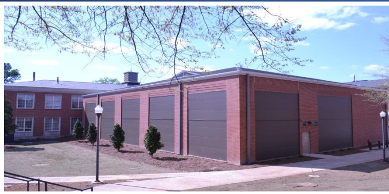
BioDiversity Learning Center ($2.7M)