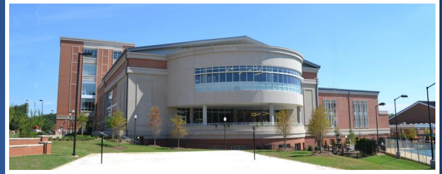
Student Wellness Center ($53M)