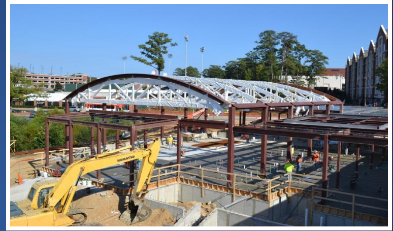
Wellness Kitchen ($5M)