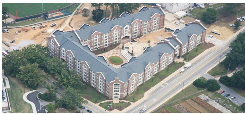
West Samford Residence Hall ($51M)