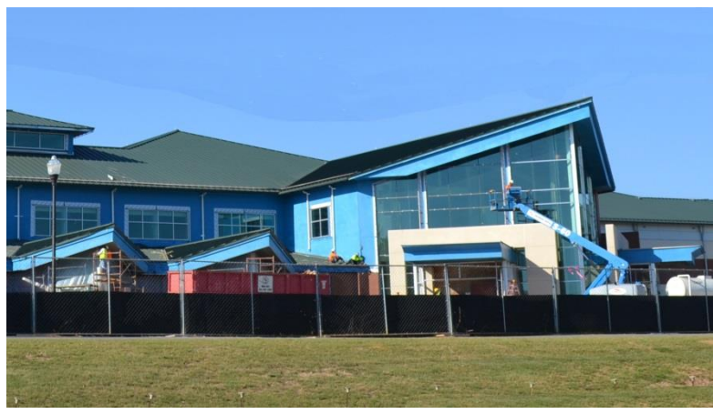
Small Animal Teaching Hospital Phase II ($47M)