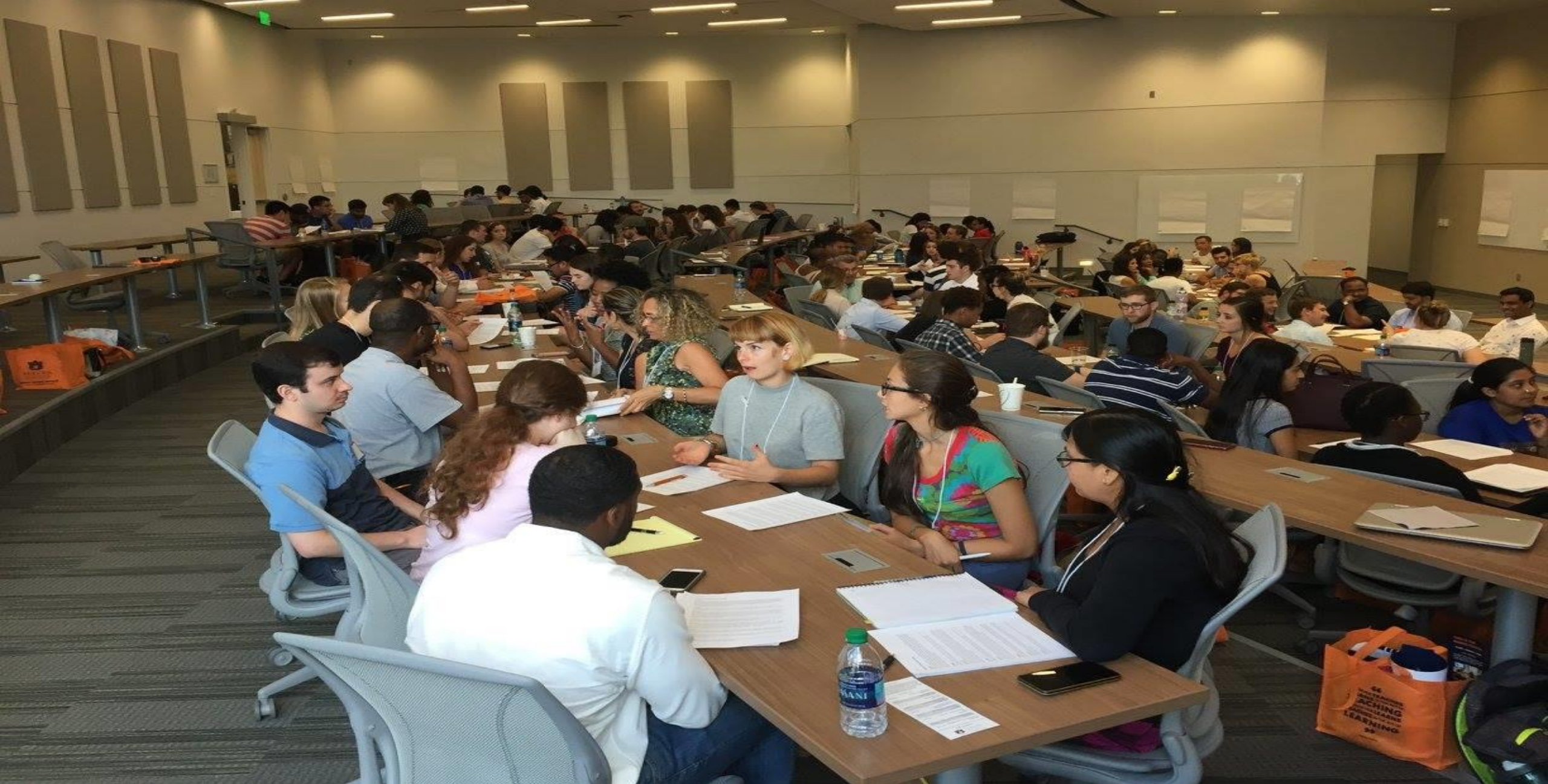
"Quading Up" in Large Lecture

New Faculty/GTA Orientation 17 August 2017