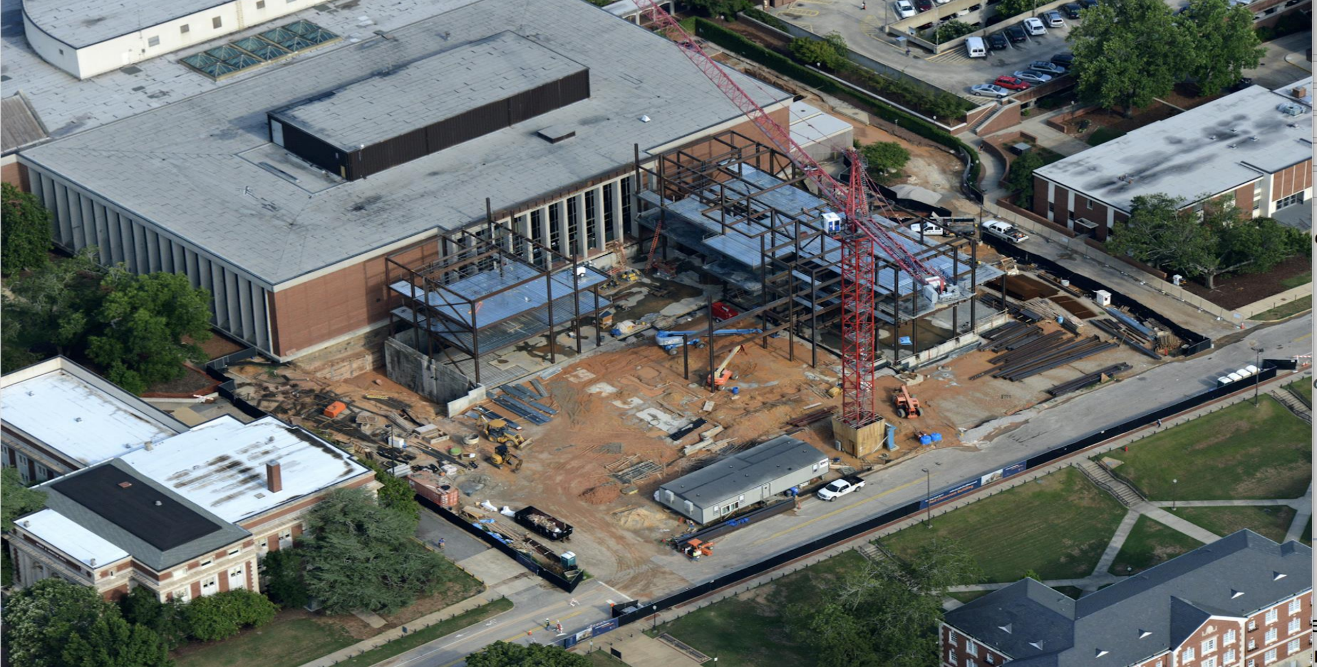
Mell Classroom Building @ RBD: August 4 2016